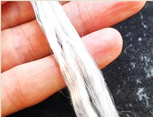
Recycled cellulose textile fibres from Sharetex