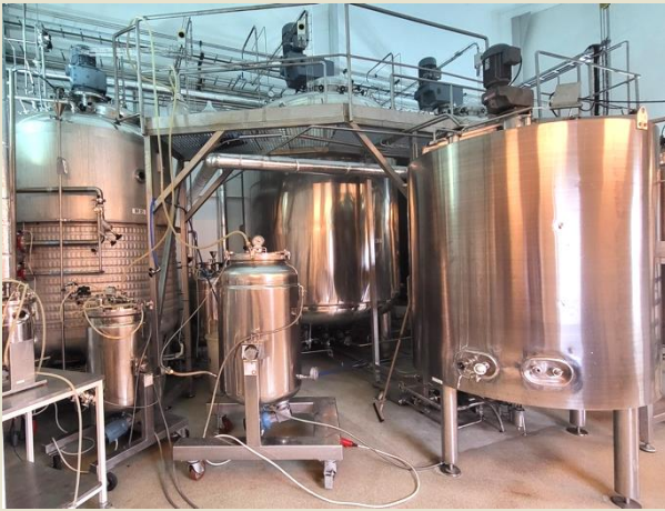
Part of the fermentation facility in Billeberga