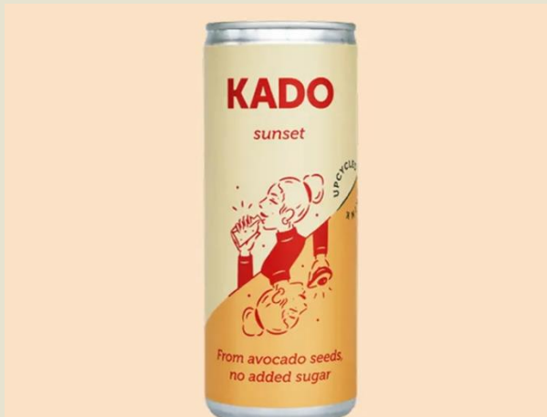
A can of Kado beverage with avocado seed extract