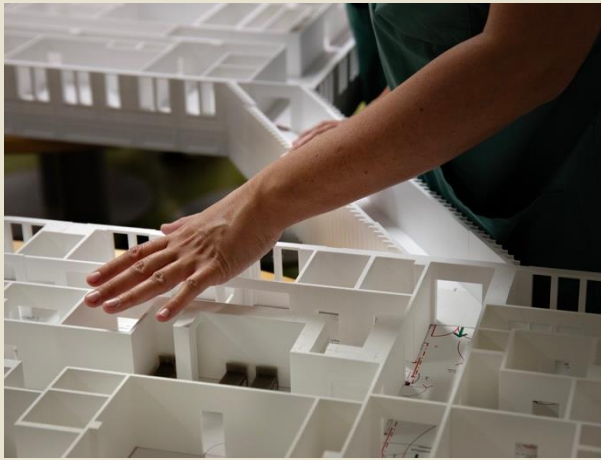
3D-printed model for architecture firm