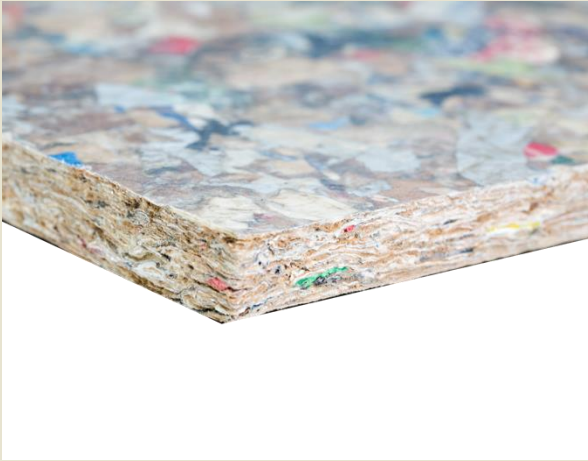
Recoma design board with visible raw material