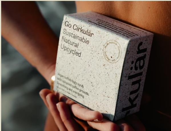
Go Cirkulär coffee body scrub